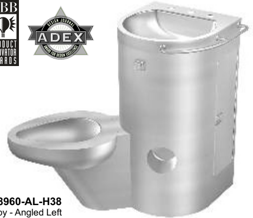
Model 8960-AL-H38 Neo-Comby - Angled Left 8"(203) Center Set