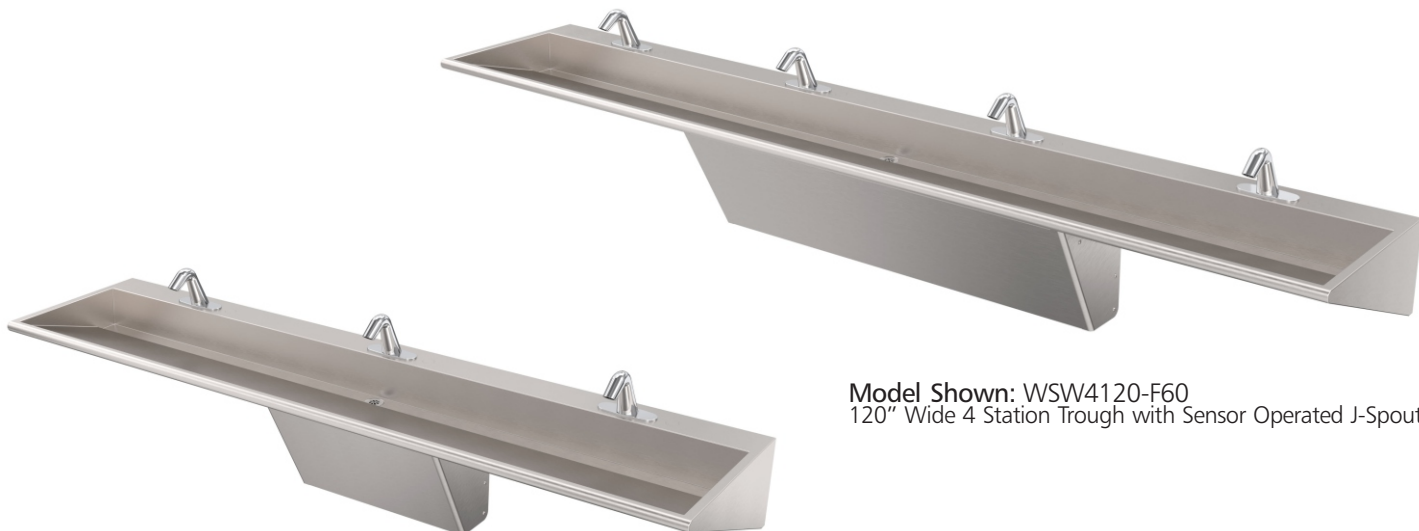
Model Shown: WSW4120-F60 120" Wide 4 Station Trough with Sensor Operated J-Spout

Additional Accessories include a Daisy (Drain) Strainer with Tailpiece and a P-Trap Assembly made of Plastic or Chrome Plated Brass.