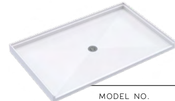
MODEL NO. CSB6030ADA-RDD-NCD2-C