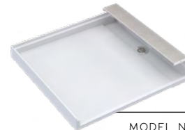
MODEL NO. CSB3636ADA-TDS-R-NC2