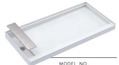
MODEL NO. CSB6030-TDS-L-NC2