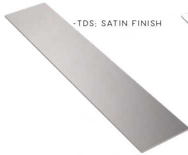
-TDS: SATIN FINISH