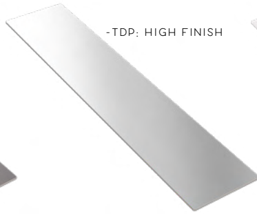
-TDP: HIGH FINISH