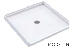
MODEL NO. CSB3636ADA-RDD-NCD2-C