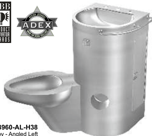
Model 8960-AL-H38 Neo-Comby - Angled Left 8\"(203) Center Set