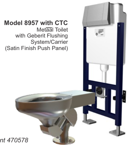
* U.S. Design Patent 470578

Applicable Specifications: Meets or exceeds ANSI 112.19.2M.